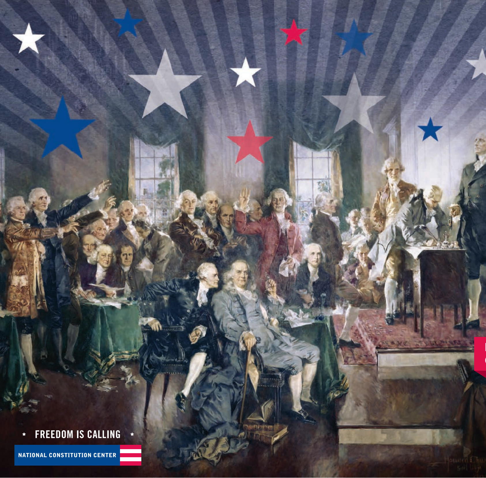
"Scene at the Signing of the Constitution of the United States," by Howard Chandler Christy, 1940.