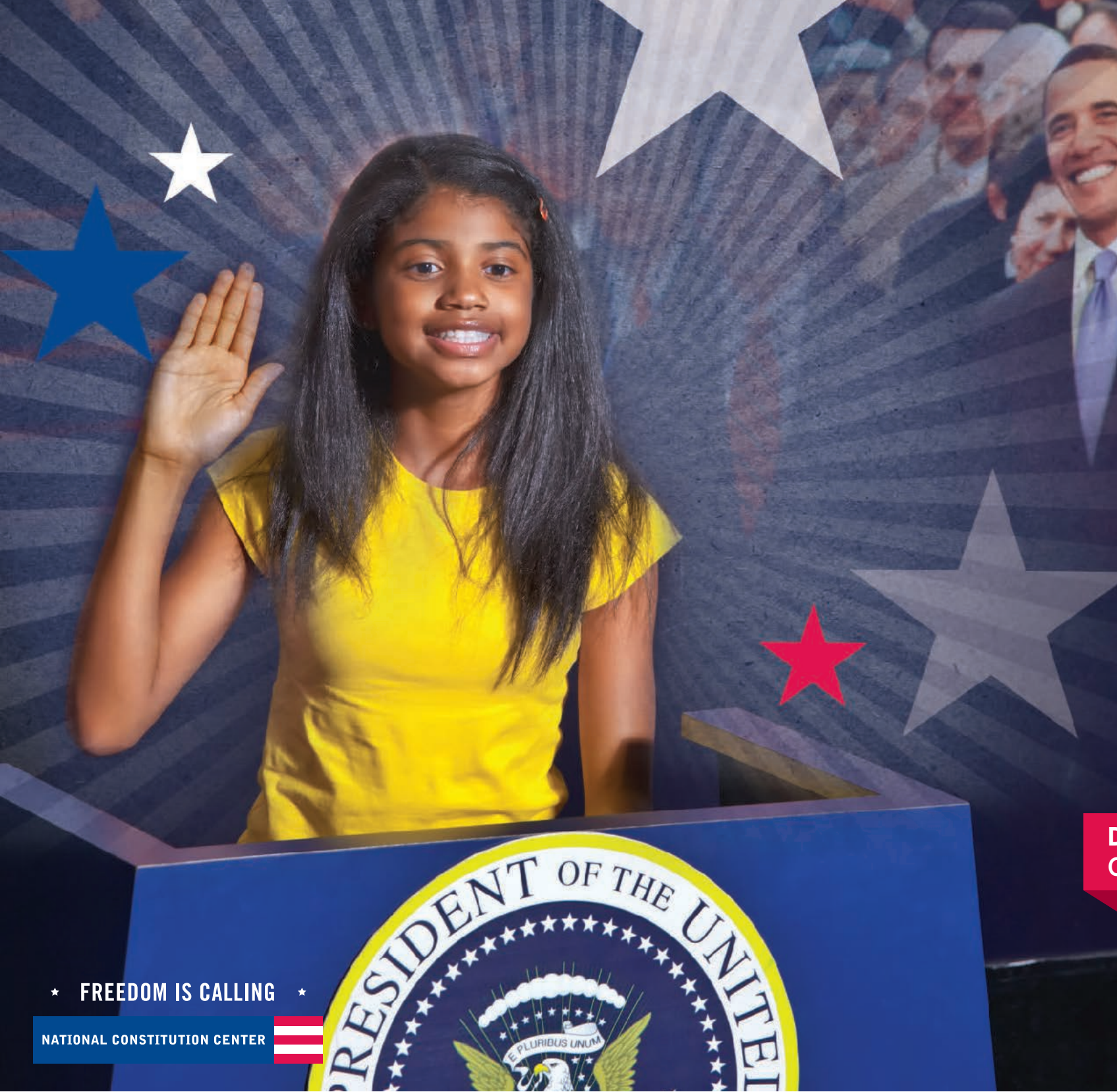
Students can raise their right hand and take the Presidential Oath of Office at the National Constitution Center.