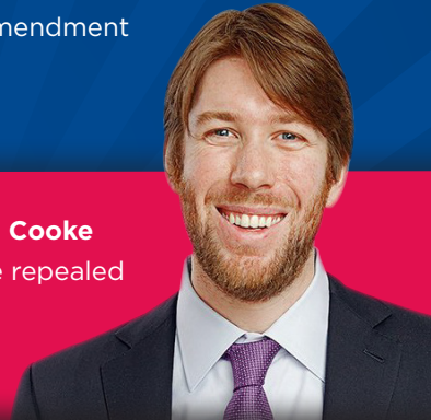
National Review Online editor Charles C.W. Cooke on whether the 17th Amendment should be repealed