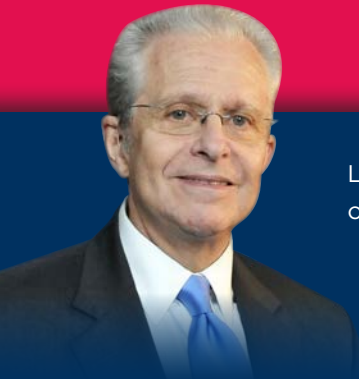
Leading constitutional scholar Laurence Tribe on the history and future of impeachment