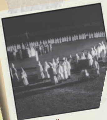
Ku Klux Klan Gathering in Field

The next part of your training takes place in the section of the exhibit on the Ku Klux Klan (KKK). Throughout history, the U.S. government has identified certain groups or people as threats to national security. As an agent, it is important that you can objectively evaluate potential threats.