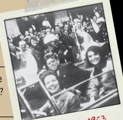
Dallas, TX in 1963