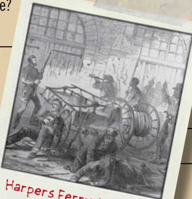
Harpers Ferry, VA in 1859

What would you have done in this situation?