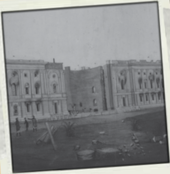
The White House Washington, D.C. 1814

Hello, Agent. Welcome to the Constitutional Intelligence Agency. This manual will guide you through our training module, Spies, Traitors & Saboteurs: Fear and Freedom in America , equipping you with the skills necessary to become one of our top agents.