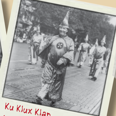
Ku Klux Klan Marching in Streets

DETERMINE THE THREAT LEVEL OF THE KKK IN 1925 ON THE THREAT SPECTRUM CONTAINED ON THE LAST PAGE OF THIS MANUAL.