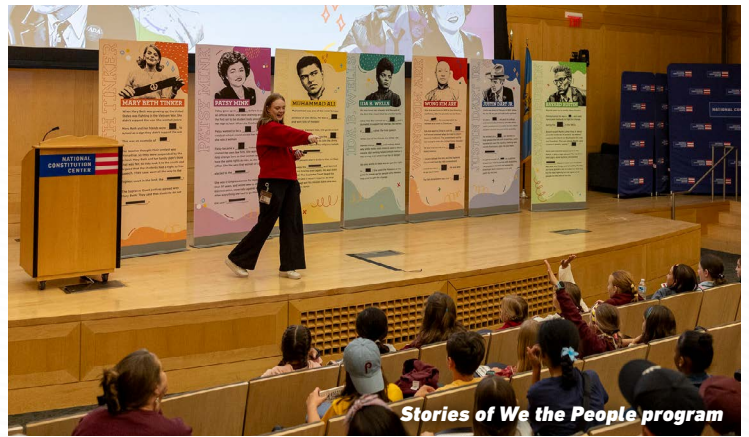
Stories of We the People program

Bring the museum to your group wherever you are with our live guided virtual tours for learners of all ages. Virtual tours provide groups the opportunity to get a behind-the-scenes experience hearing the personal stories and historic context that bring the Constitution to life.