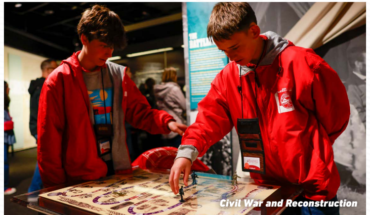
Civil War and Reconstruction