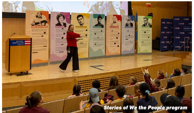
Stories of We the People program

Bring the museum to your group wherever you are with our live guided virtual tours for learners of all ages. Virtual tours provide groups the opportunity to get a behind-the-scenes experience hearing the personal stories and historic context that bring the Constitution to life.