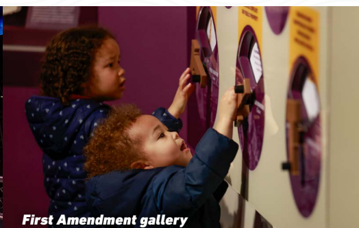
First Amendment gallery