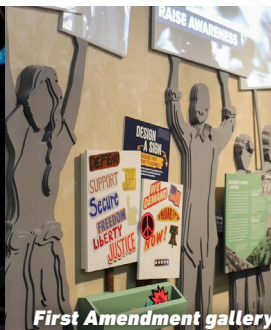
First Amendment gallery