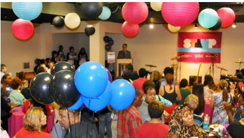
Students gather for the launch of STAMP on October 4, 2013 at the African American Museum in Philadelphia.

Click here to download print quality versions of the photos below.