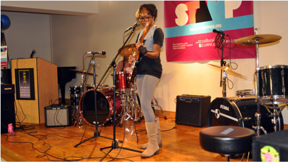
Members of Girls Rock Philly perform at the STAMP launch event.