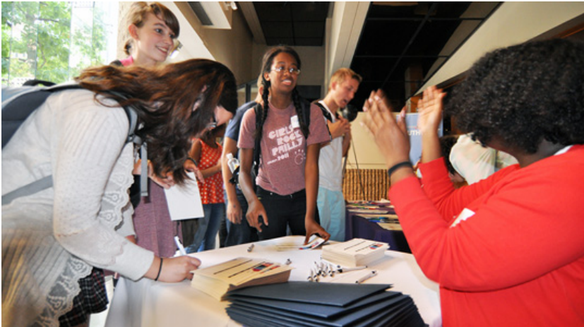
Members of Girls Rock Philly sign in for the STAMP launch event at the African American Museum in Philadelphia.