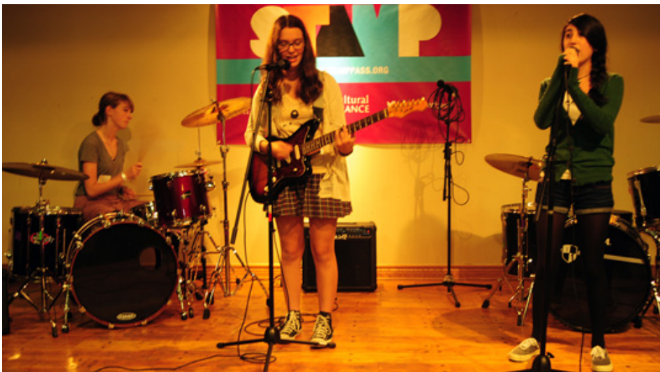
Members of Girls Rock Philly perform at the STAMP launch event.