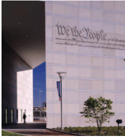
1 "We the People" façade at the National Constitution Center