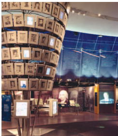
5 The American National Tree tells the stories of 100 Americans whose actions have helped write the story of the Constitution.