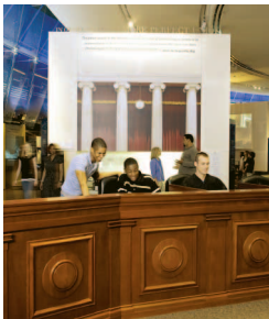
3 Students sit at a replica Supreme Court bench to decide on landmark cases inside The Story of We the People .