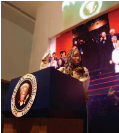
2 Students take the Presidential Oath of Office inside the Center's main exhibition, The Story of We the People .